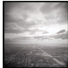
Chicago Aerial No.1, 2006