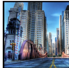
LaSalle Street, 2005 (Detail)