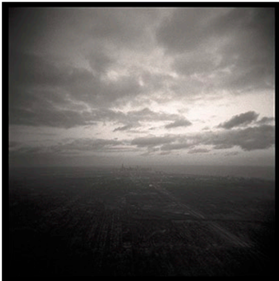
Initial Scanned Negative

The negative film inside my holga has a high dynamic range. Scanning and examining each negative at 4000dpi reveals much information that might not be immediately visible. These environments are painstakingly reconstructed, distilling the moment of capture from the myriad of Holga characteristics. Lens distortion is corrected, uneven exposure is adjusted, and frames are recropped. The image is rebuilt in the same fashion a childhood memory may be recalled - details (often idealized) slowly emerge with care and patience.